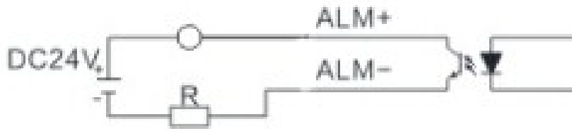
Alarm in place output wiring diagram