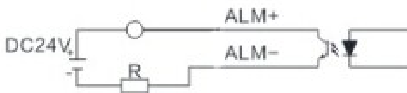
Alarm in place output wiring diagram